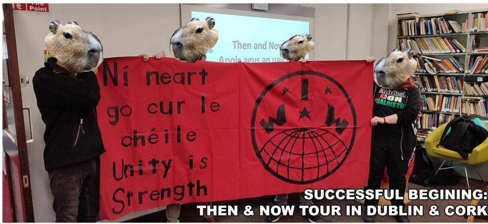
SUCCESSFUL BEGINING: THEN & NOW TOUR IN DUBLIN & CORK

On 10th and 11th of November, the Industrial Workers of the World in Dublin and Cork hosted a history talk and discussion, that formed part of the radical union's Then & Now Tour. This was the start of a nationwide speaking tour, which includes an overview, in Irish and English, of the union's history (presented by an IWW member), along with an update by local union activists.