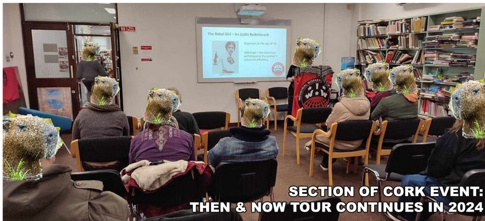
SECTION OF CORK EVENT: THEN & NOW TOUR CONTINUES IN 2024

We're grateful for the hospitality from our FWs in Dublin and Cork, and look forward to meeting you in Derry, Belfast, and Galway next year - keep an eye on our social media for more details!