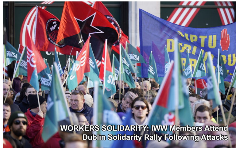
WORKERS SOLIDARITY: IWW Members Attend Dublin Solidarity Rally Following Attacks

Don't let these fascists into your communities. We've watched the police and government allow these fascists spread their agenda. We've seen them sit back and do nothing as fascists set fire to refugee centres and harassed workers in schools and libraries.