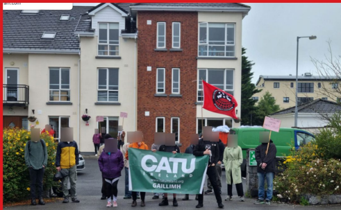
IWW Galway solidarity with asylum seekers

On the way they left a trail of wanton destruction in their wake, attacking business-