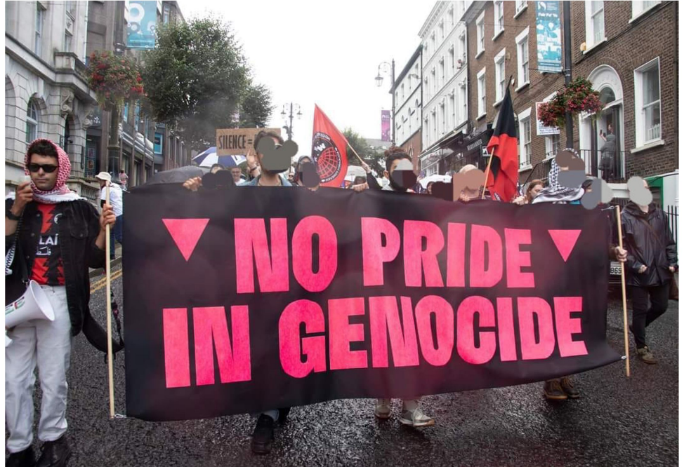
IWW Derry: Pride Solidarity with Palestine in Derry, Ireland.

"We are witnessing the deliberate genocide of the Palestinian people by the Zionist terror regime. A regime which is being fully armed and assisted by so called democracies, in which our own country, its government, is complicit through its continued silence, not to mention the use of Shannon Airport.