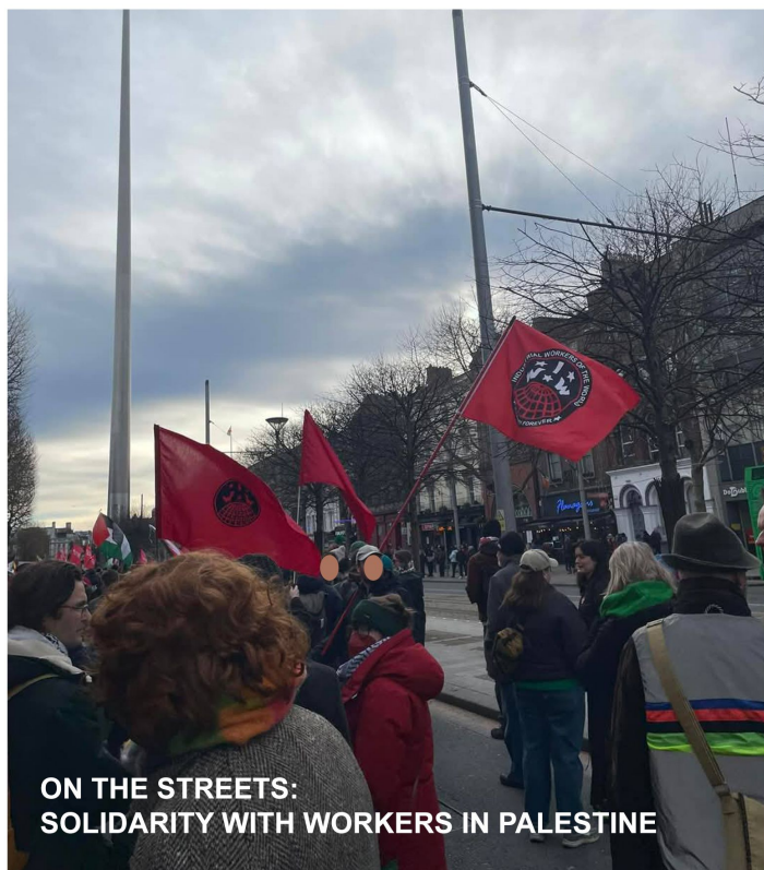
ON THE STREETS: SOLIDARITY WITH WORKERS IN PALESTINE

"We applaud and encourage continued direct involvement of the labour movement in the cause of Palestine. Ordinary workers, taking action collectively through strike action, stoppages or blockades, as well as growing the active boycott movement with the disruption of Israeli goods as a form of direct action in opposing war and the ongoing genocide in Gaza.