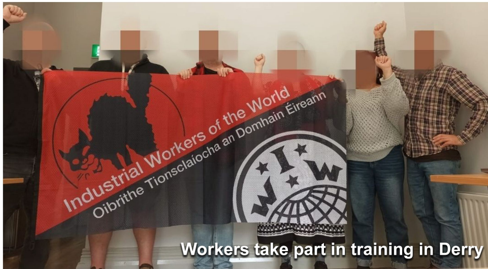
Workers take part in training in Derry

The Industrial Workers of the World in Ireland held its latest round of Workplace Representative Training for mem-