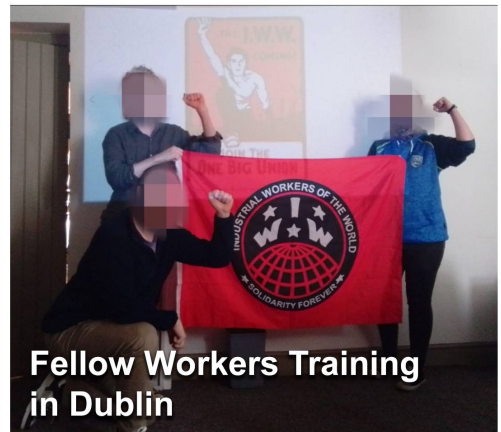
Fellow Workers Training in Dublin

For those who would like to get active, to unionise your self and your fellow workers, you can join the IWW today!