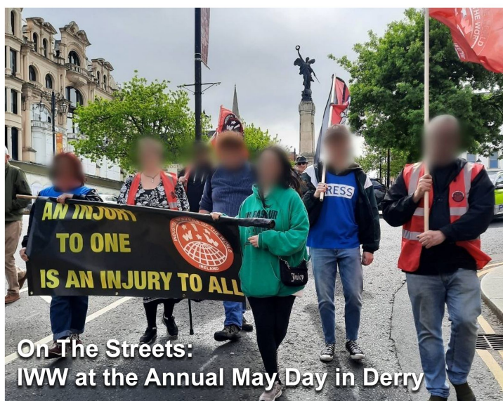
On The Streets: IWW at the Annual May Day in Derry

"As a gesture of international solidarity with journalists, many today wore distinctive blue Press vests to help highlight the deliberate targeting of journalists. This is a deliberate effort by many regimes, to silence the reporting of genocide and other war crimes.