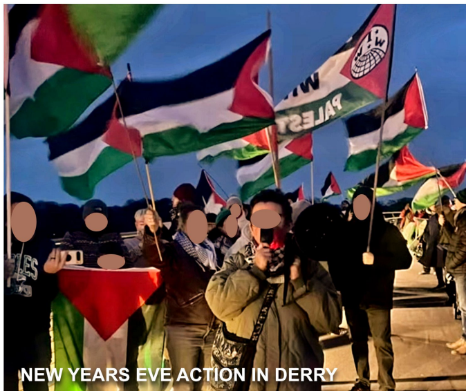
NEW YEARS EVE ACTION IN DERRY

onists and their Western backed governments who have aided and abetted the genocide that the world has been witnessing. Let no one deny that they did not know of the genocide being brought upon the people of Palestine at this time. It is up to all of us to be on the streets, to help bring this nightmare to an immediate end and for the perpetrators brought to justice."