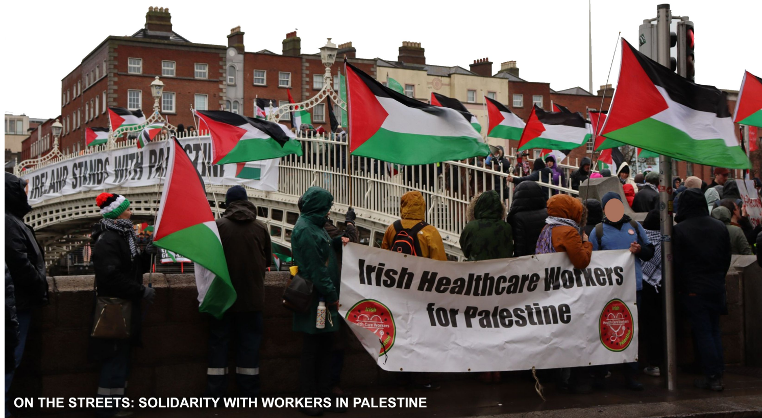
ON THE STREETS: SOLIDARITY WITH WORKERS IN PALESTINE

The Industrial Workers of the World took part in solidarity actions with Palestine over the New Year. Actions organised by the Ireland Palestine Solidarity Campaign took place around the country in towns, villages and cities expressing continuing support and solidarity with Palestine and for an immediate end to the genocide.